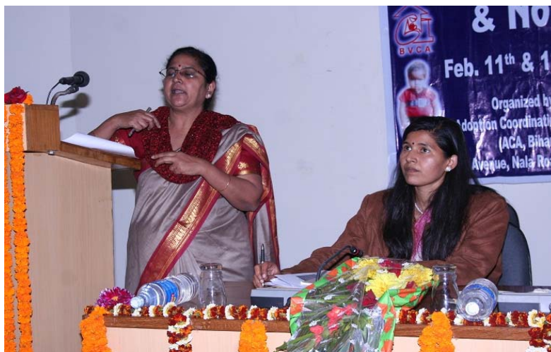
I st day Session-